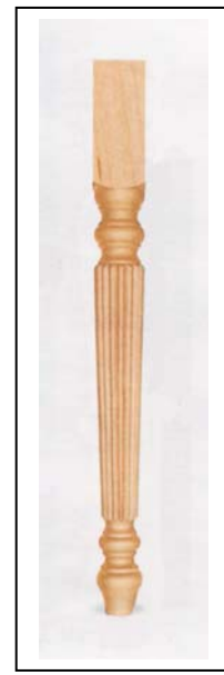
A905-2 2\frac{3}{4}'' \times 2\frac{3}{4}'' Length: 15.5'', 21'', 29''