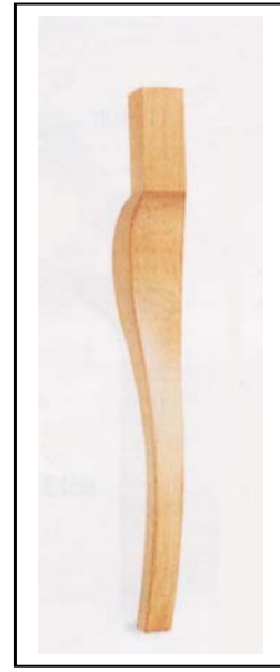
ACF-1 \frac{3}{4}'' \times 1\frac{3}{4}'' Length: 15.5'', 21'', 29''