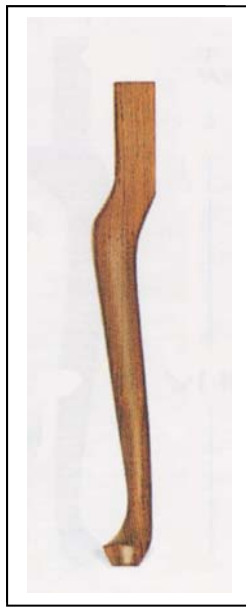
ACW-1 1\frac{7}{8}'' \times 1\frac{7}{8}'' Length: 15.5'', 21'', 29''