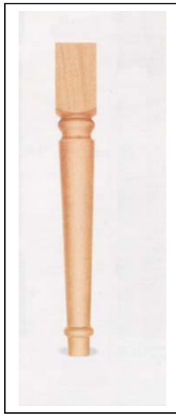
A901-2 2\frac{3}{4}'' \times 2\frac{3}{4}'' Length: 15.5'', 21'', 29''