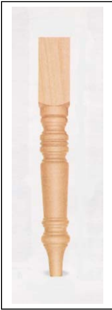
A900-2 2\frac{3}{4}'' \times 2\frac{3}{4}'' Length: 15.5'', 21'', 29''